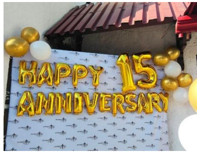
Happy 15 th Anniversary!