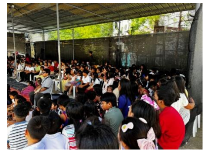
This was a children's service on an Anniversary Sunday.