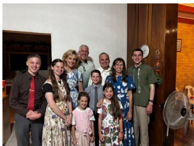
It was good to have the Wilkersons in Dumaguete again.