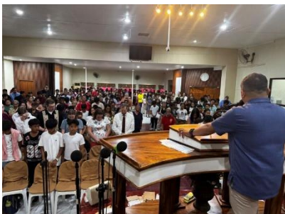
This is a filled auditorium during our Anniversary Sunday.