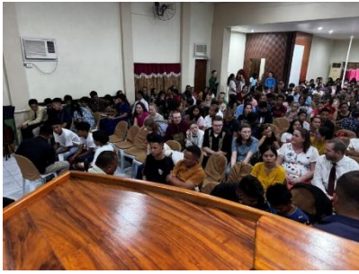
People heard the Gospel during the invitation.