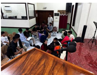
People heard the Gospel during the invitation.