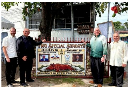
We were blessed to have these great men visit us.