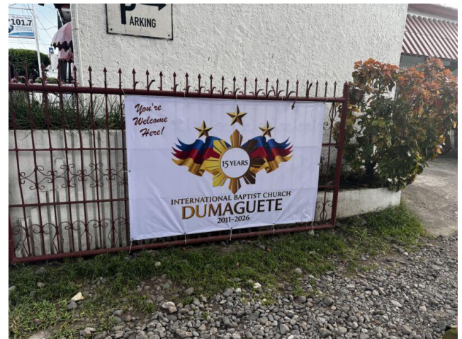
We celebrated 15 years—2011 – 2026!