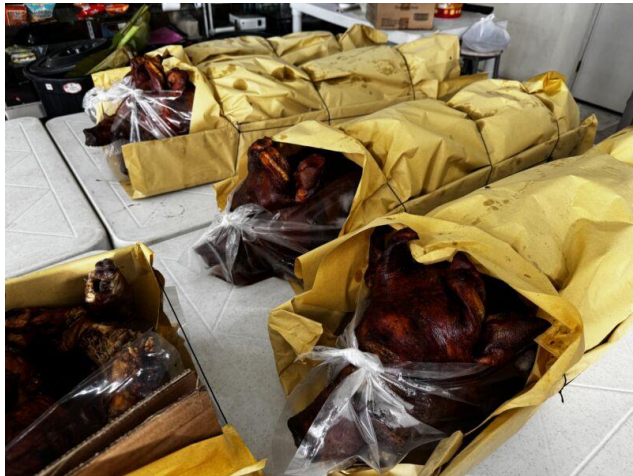
We served lechon baboy ("roast pig") after the Anniversary Sunday services.