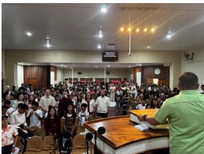
We had more than 400 chairs filled in the auditorium.