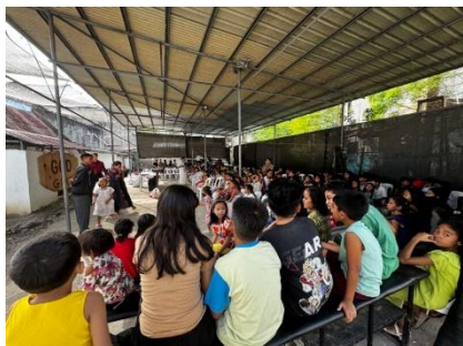
This was our children's service on an Anniversary Sunday.