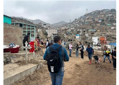
Our church folks are winning souls for Christ on the Day of the Dead!