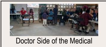
Doctor Side of the Medical

As we enter this season of giving thanks, there is much for which I have to be thankful. I am thankful that we can bring our requests before God and for those who have prayed for me. A week ago, I got sick with an awful sore throat/tonsillitis . Due to my not being in school, our teachers messaged me, saying they were praying for me. Folks in America also messaged me on Facebook. Thank you for your faithful prayers. Thank you for praying for my storage totes and donated toys to come. They arrived on the shipping container on October 13! Praise God! No, the customs officials haven't told us yet about the cost of the taxes for the items.