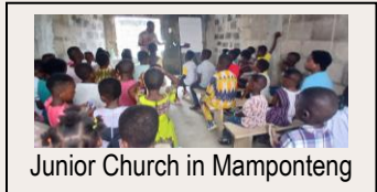
Junior Church in Mampong