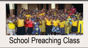
School Preaching Class

come, and they have decided to keep it at a permanent location. Some of these children come to the Saturday soul-winning meeting, a large handful come to the Sunday morning service, and there are about 10 who come Sunday and/or Wednesday nights. Praise the Lord! On October 24, I had my last weekend in Mampong . It's been exciting to see their workers grow in their understanding of Bible Clubs and the church's children's ministries. There has been a lot of growth in their Junior Church! Please continue to keep them in prayer as they work to reach the parents of the children also. This school term, I was able to help with the public-school ministry at a