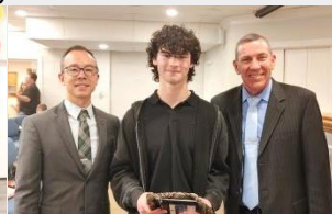
Heaven Rejoices After the Service