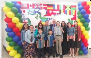
One of Many Amazing Meetings