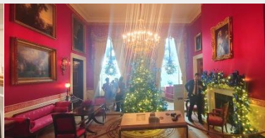
Red Room in the White House