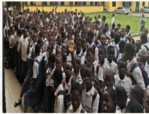
Preaching to 1 st half of Rumuepirikom School