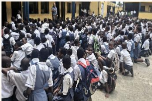
2 nd half of Rumuepirikom School