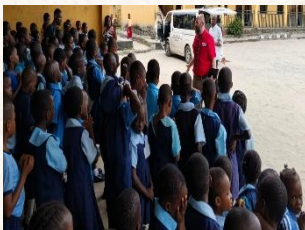
Preaching at Rabisi School