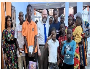
Some of our 20 visitors