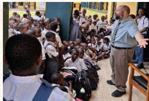
3 rd group at Rumuepirikom Community School