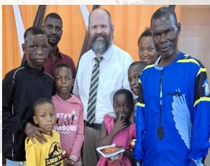
Some of our 13 visitors