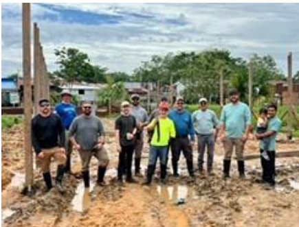
This is a before picture of our church-building project in the jungle.