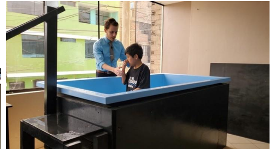
I was privileged to baptize 10 people on our Baptism Sunday.