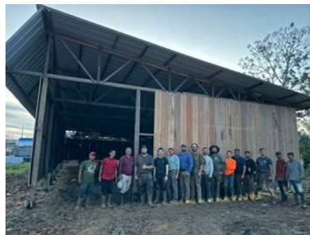
This is an after picture of our church-building project in the jungle.