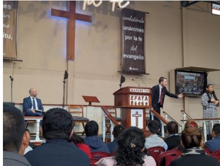
I was grateful to preach at our Pastors' Conference in Lima.