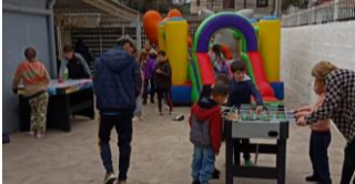
Some games we rented