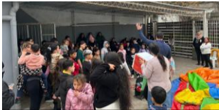
Witnessing to the children and their parents