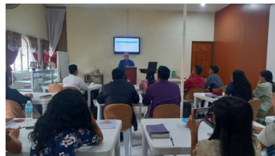
Teaching in our upgraded room with a new folding wall

Our growth in attendance led to a project which took out the back wall of our auditorium and put a folding wall in its place. When needed, we can open it for more auditorium space. When closed, it creates a nice, large, all-purpose room to have Sunday school and college classes. We did the work ourselves, being led by one of our college graduates who used to be a civil engineer.