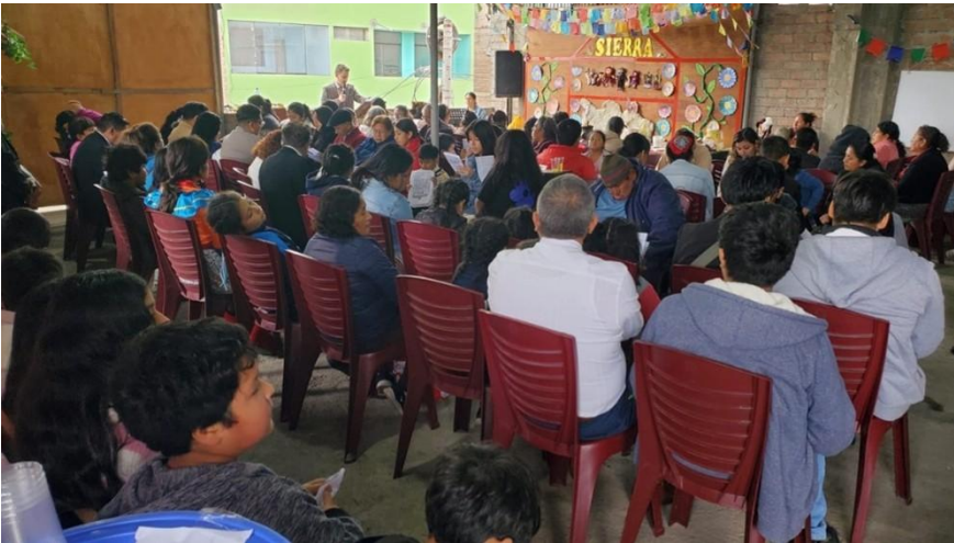
On the last day of our attendance program, we had a special service with food on the roof of our church—it was a great success!