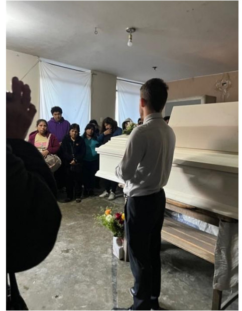
I was able to give the Gospel at the viewing for this dear lady.