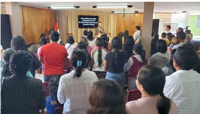
We had a wonderful Resurrection Sunday!