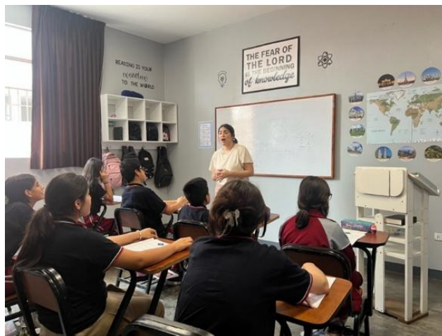
Classes at our Christian school are going great!