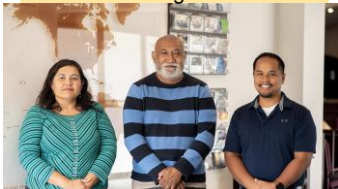
Southland Baptist Press