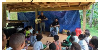
Sunday School in PNG