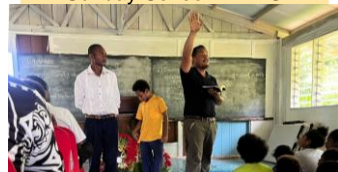
Preaching in PNG