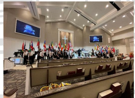
Parade of Nations at Temple Baptist Church, Dulles, Virginia