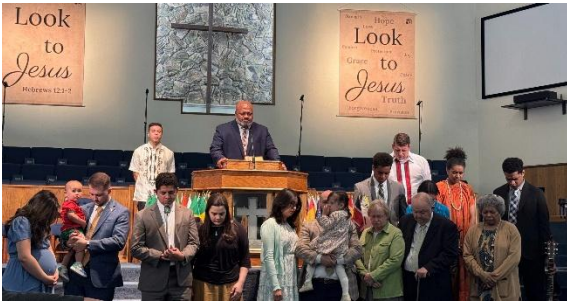
Missions Conference at Liberty Baptist Church, San Jose, California