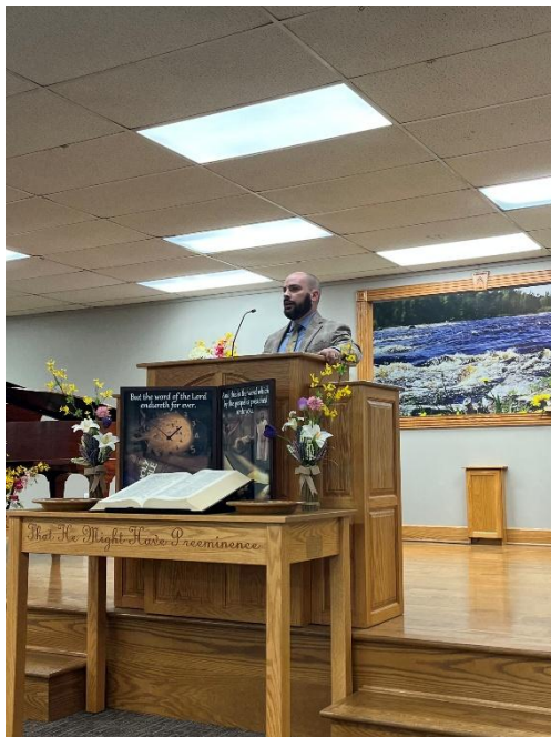
My Ordination Service