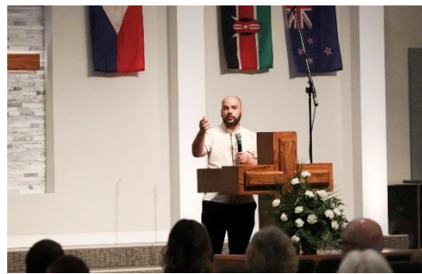
Sharing my testimony at Neuse Baptist Church, Wake Forest, North Carolina