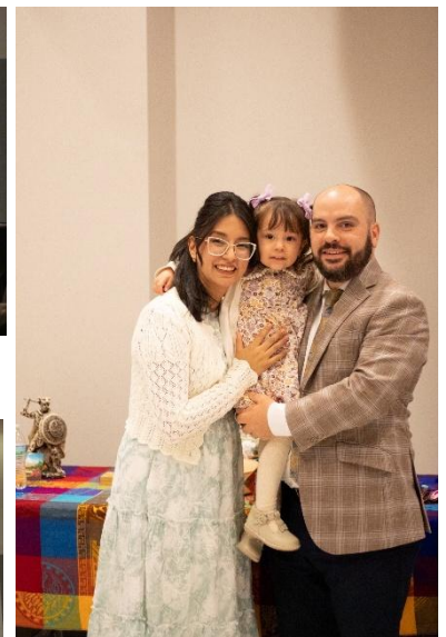
Our family at Neuse Baptist Church, Wake Forest, North Carolina