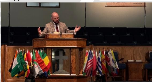
Preaching at Liberty Baptist Church, San Jose, California