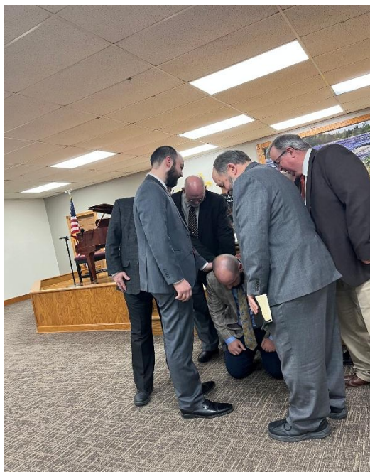
My Ordination Service