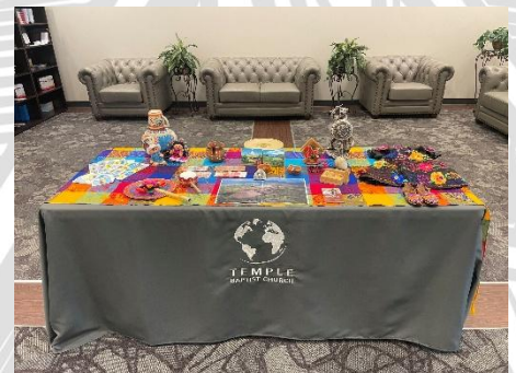
Missions Conference at Temple Baptist Church, Dulles, Virginia