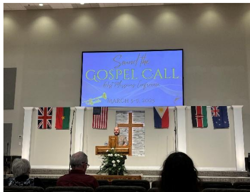
Missions Conference at Neuse Baptist Church, Wake Forest, North Carolina