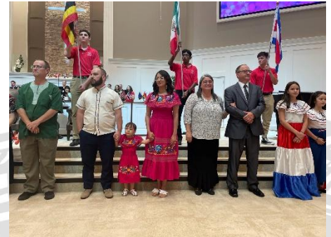
Prayer for the missionaries at Temple Baptist Church, Dulles, Virginia