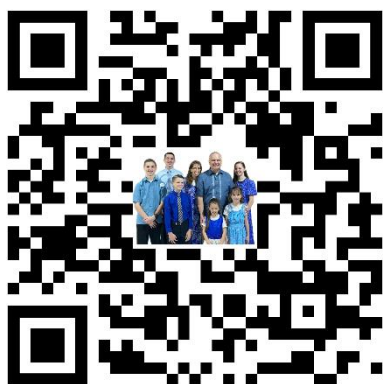
Video of our ministry