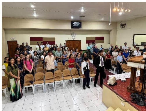
Thursday evening soul-winning group