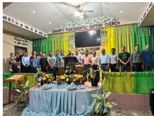
Pastors at a Missions Conference I preached in February