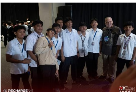
Public school teens in Davao