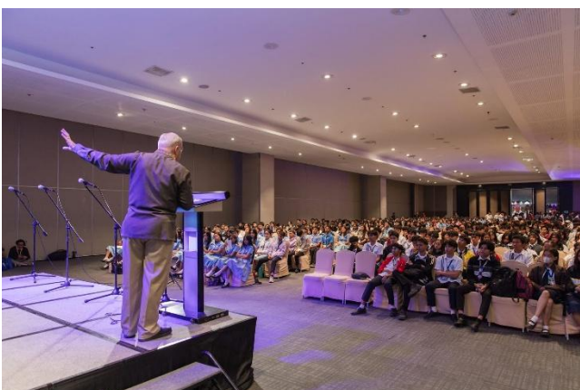
Preaching to public school teens in Davao