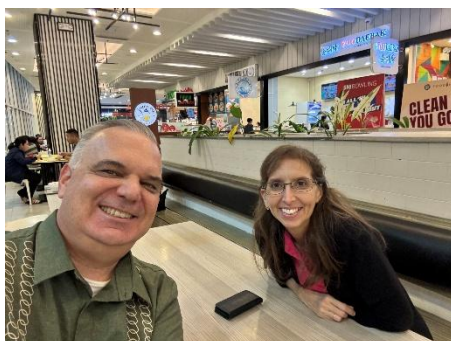
My wife and I in Davao—she was able to speak to the ladies.