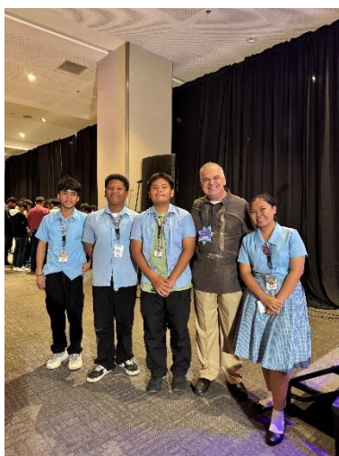
Public school teens in Davao