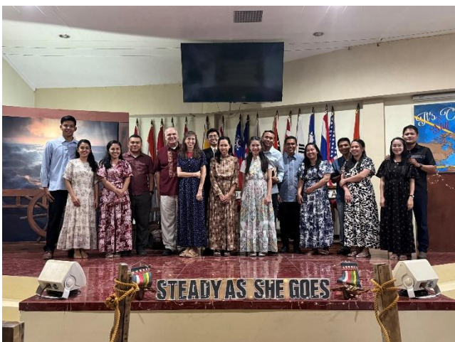
My wife and I with the couples I've married