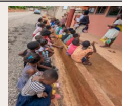
First Bible Club

middle-back pain from sleeping wrong the night before. After lunch, the pain seemed to be worse, and it also made breathing very hard. That night, I stayed home and rested, thinking the heating pad was helping so much. The next morning, I went to the hospital/clinic here for my first time . The doctor told me that I had pneumonia , and I was surprised. I'd never had pneumonia that caused pain like I was experiencing. I praise the Lord that after a few days , I had no more trouble breathing and was doing much better.