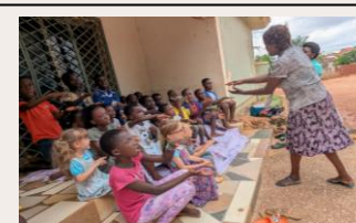
Singing at the New Location

missionary story, it's important for me to share the Gospel message, because it's surprising how many children will arrive randomly in the ending part of club when we are singing or during the missionary story. I am thankful for the many children who have heard the Gospel for their first time and accepted Christ as their Saviour . Please pray with me that these children will grow in Christ! Would you please pray for our SMITE camp here in Ghana April 28 – May 2? Several of our schoolteachers and teenagers are excited to attend. I also am excited to learn more and see how we are teaching young people to do Bible Clubs.