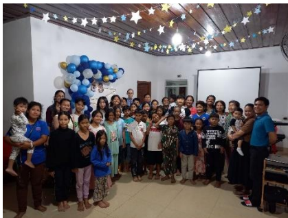
18th Anniversary Service