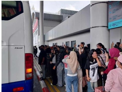
Well-wishers greeting us after a successful evangelism campaign—they cannot contain their excitement! (JUST KIDDING!)