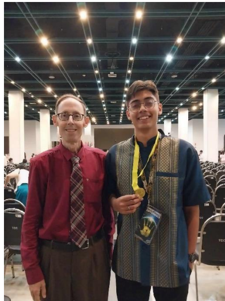
A well-deserved medal