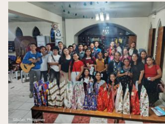
Teen Christmas Caroling Activity