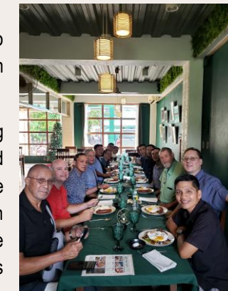
Men's Breakfast Activity with My Father