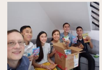
Care package from Liberty Baptist Church, Yuma, Arizona

SENDING CHURCH First Baptist Church 507 State Street Hammond, IN 46320 219.932.0711 fbchammond.com