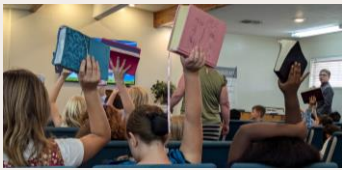
Sword Drill in Mesa, Arizona

Where do I start? So much excitement has happened these past few weeks! I will start with praising the Lord for answering our prayers. Its official—I have approval to be finished with deputation! I have a few more meetings, and then I will be flying out to Ghana. I am so thankful for you. Through Christ's faithfulness, your faithful prayers and financial giving have made the ending of my deputation possible.