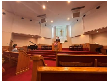
First time preaching in Japanese at Senri Newtown Baptist Church