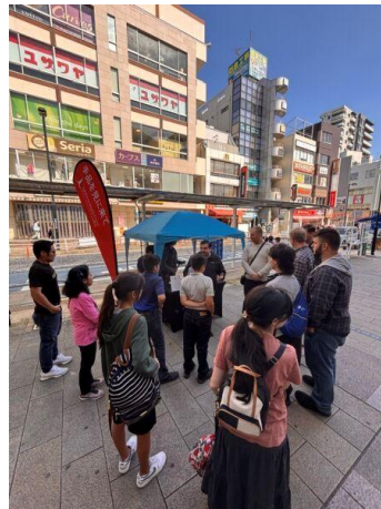
Passing out tracts at Yamato Station during the Missions Conference in Lighthouse Baptist Church, Yamato City