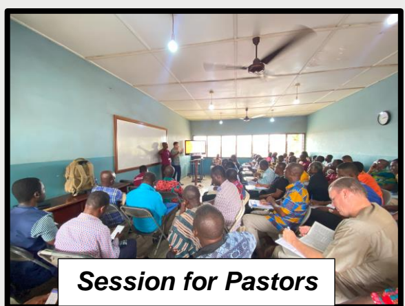
Session for Pastors