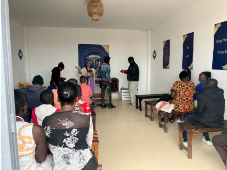
Church members playing a Bible game during Sunday school