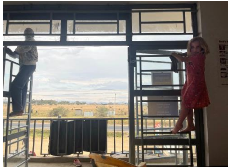
Our kiddos cleaning the windows at church