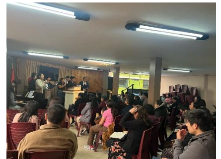
I am thankful for a great church!