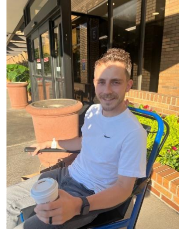
I am grateful to be leaving the ICU!