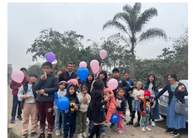
This is one of our bus routes from Children’s Day. These kids had a great time!

That Sunday, we had a big day for Children’s Day in Peru. We had a bus-route competition to see who could bring the most people. One bus captain won with a high day of 45 people. We ended up having about 80 kids and over 160 in church, and 20 people made a profession of faith that day.