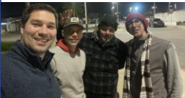
Men's Soul Winning