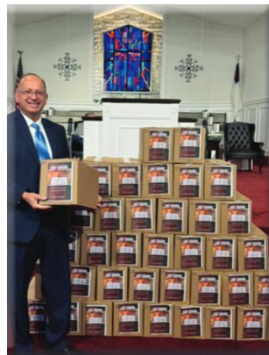
10,000 John and Romans