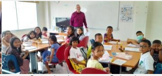
Saturday Language School