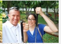
Nong Phlap Land