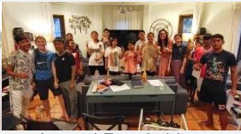
August 1 Teen Activity