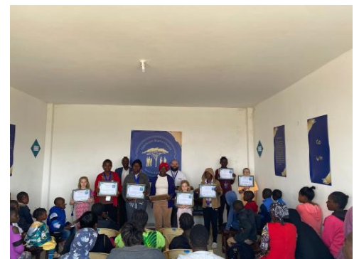
These teens graduated from the discipleship program!