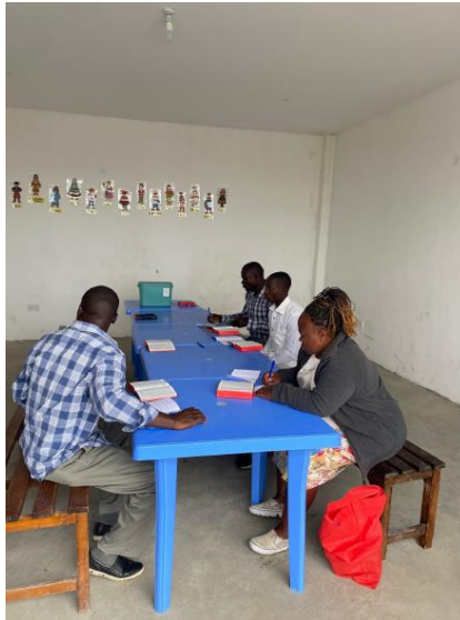
This is our New Beginners' Class held during our Sunday school hour.