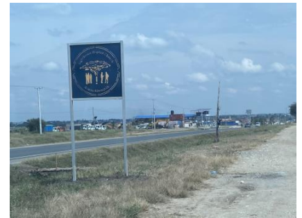
Our new church sign is up!