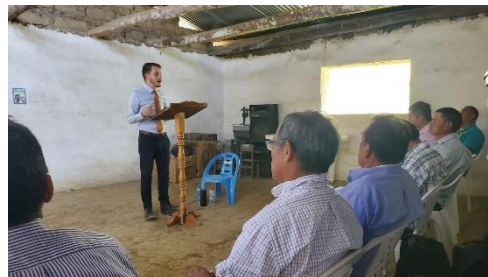
I enjoyed working with the pastors in Las Vegas, Peru.