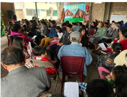
We had a great day celebrating the independence of Peru.