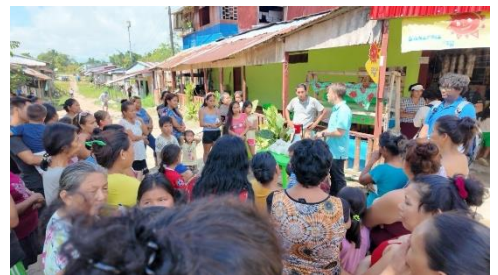
It was a joy to share the Gospel in Iquitos, Peru.