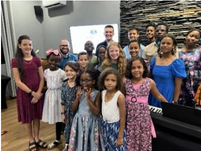
English Piano Students

We have added more ministries to the church within the last couple of months. I started a Swahili piano class for a few of our members. We meet every Saturday after visitation. This has been a challenge for me language-wise, as some of the musical terminology doesn't often translate into Swahili. Our song leader has started to play some congregational hymns during the services. Through teaching, I have learned that the Swahili translations of popular hymns don't always follow the original timing. Translating English into Swahili is more of a thought-for-thought versus word-for-word process. My English piano students have finished their lessons for the summer. We held a piano recital for the families, and all 18 of my students did a great job playing their selected pieces.