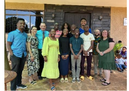
International High School Graduates