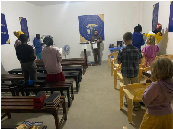
Thursday night midweek prayer service