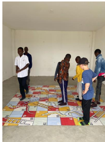
The boys playing Snakes and Ladders at our monthly teen activity