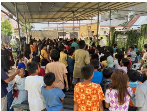
Final Day of VBS