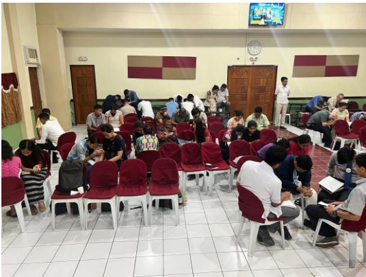
Monthly Missions Prayer Meeting