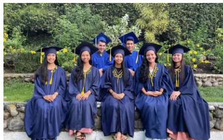
These seven graduated high school from our homeschooling ministry.