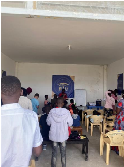
A full house for church— Praise the Lord!