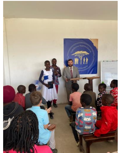
One of our teens earning her Bible