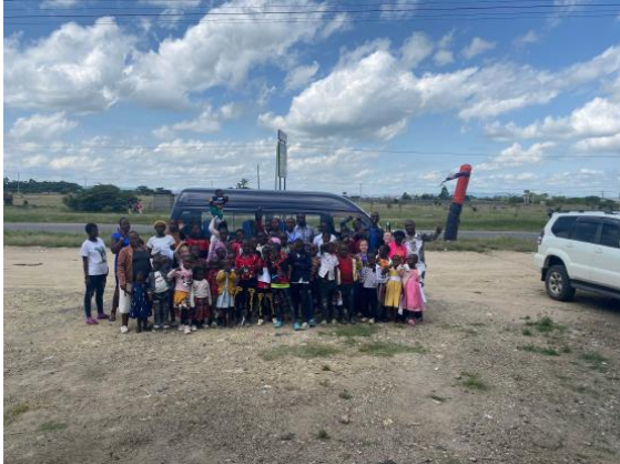
Asante Sana ("Thank you very much") to all those who gave toward the church van!