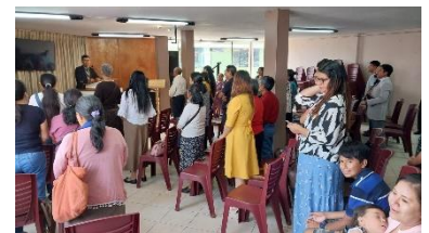
It's exciting to see our church in Peru growing, even when we're not home.