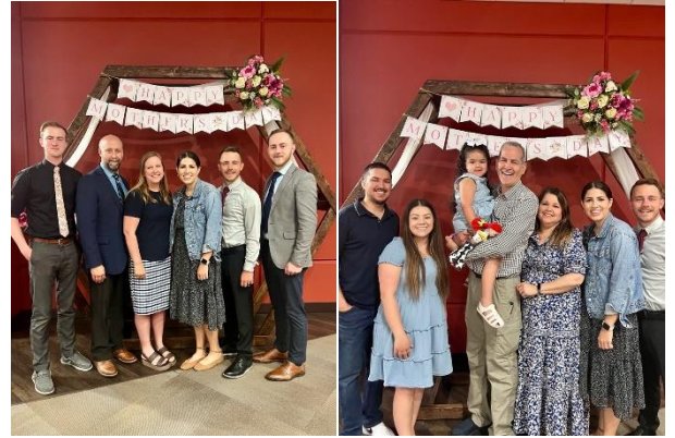
We were glad to be with both of our mothers on Mother's Day!