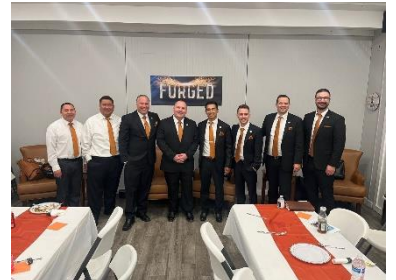
It was exciting to serve with these wonderful men at the Our Time Youth Conference.