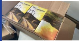
My in-laws brought us many John & Romans, as well as other literature.