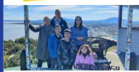
We visited the beautiful Uruguayan coast with my in-laws.