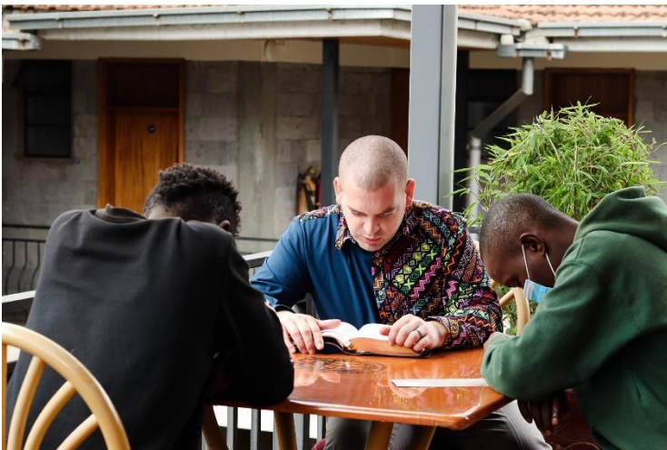
James and Nicodemus calling upon the Lord as their Saviour