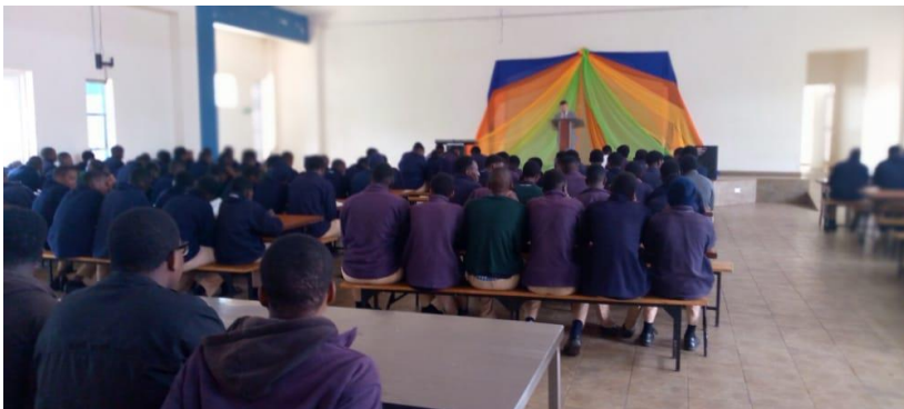
Preaching at the boys' school