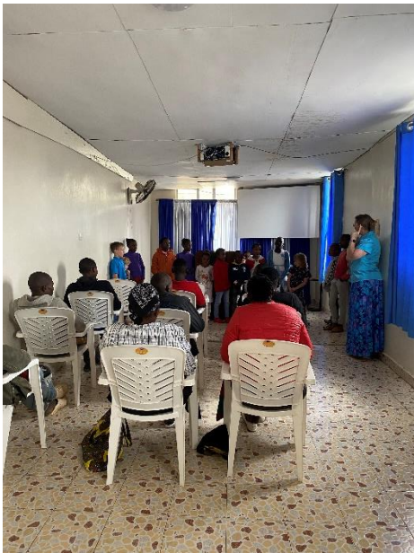
Children singing before church