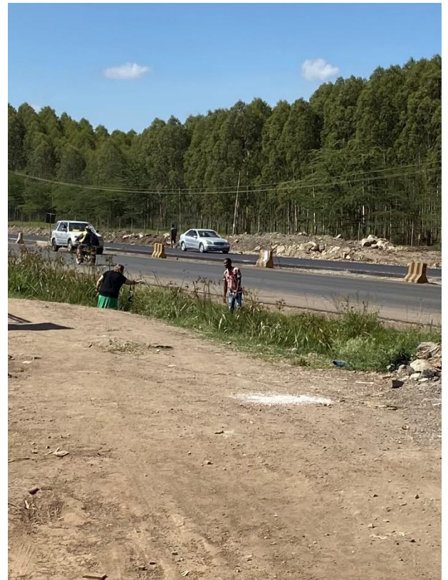
Ali going out into the "highways and hedges" to get someone to come to church on Sunday morning!