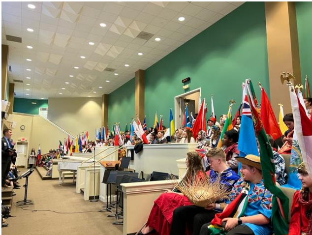
Speaking to those participating in the Parade of Nations at First Baptist Church's Missions Conference