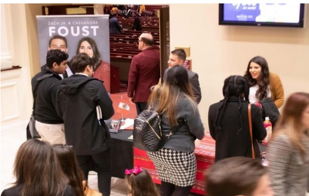
At our display at the Missions Conference at First Baptist Church of Hammond, Indiana