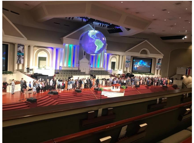
All those called to missions in the past or during the Missions Conference at First Baptist Church of Hammond, Indiana