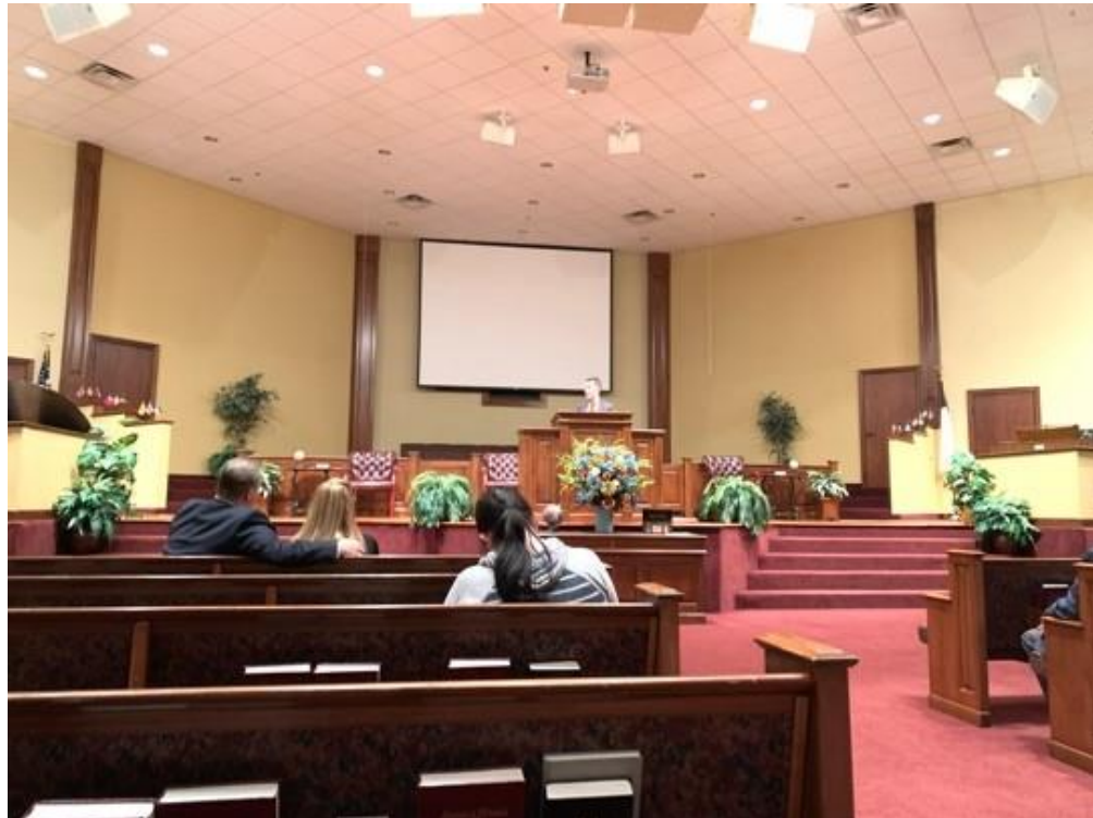
Zach preaching at Grace Baptist Church of Delaware, Ohio