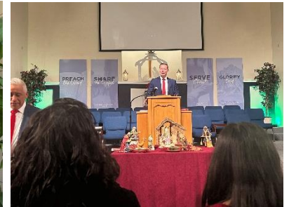
Presenting our ministry in Spanish at Iglesia Bautista de Sacramento