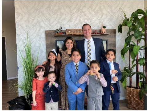
Our family at Central Baptist Church Orange County, California