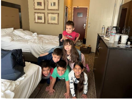
Our kids being goofy!