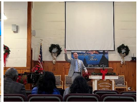
Preaching at Central Coast Baptist Church Marina, California