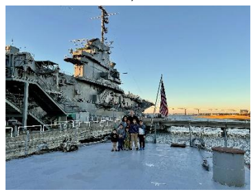
USS Yorktown, Charleston, South Carolina