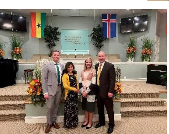
Victory Baptist Church, Charleston, South Carolina