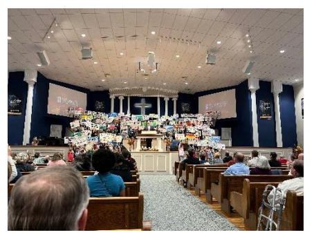
Fellowship Baptist Church, Durham, North Carolina