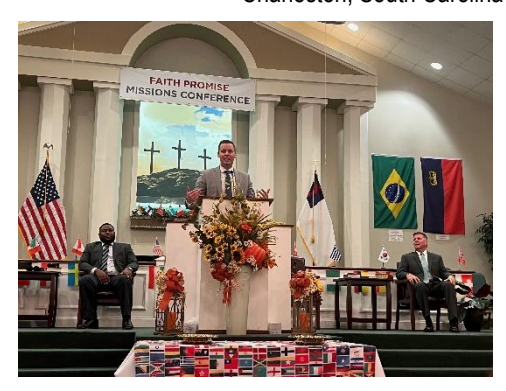
Trident Baptist Church, Goose Creek, South Carolina