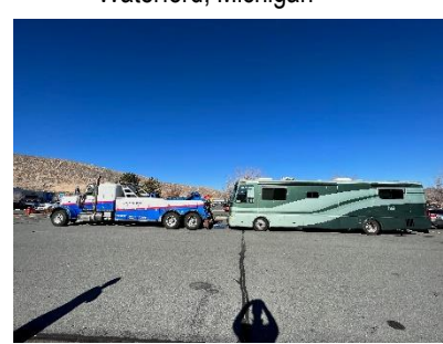
Our RV getting towed away