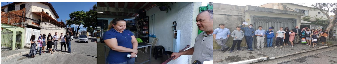
God has been so good to allow us to serve Him. We thank the Lord for at least 80 people who have responded to the Gospel in the past 4 months (January through April). We always come back rejoicing!