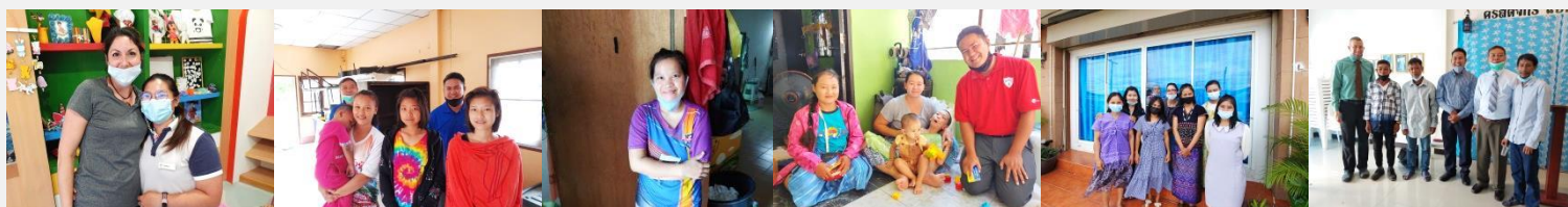
Look Dtarn (26) - Salvation Daa w/ Bow (16) & Been (19)-Saved Naw Eew (28) - Saved Cho Cho w/ Moppew (32) - Saved June 6, 2021, Happy Ladies June 6, 2021, Glad Men

Grateful to serve, Bro. Chad Inman & Family